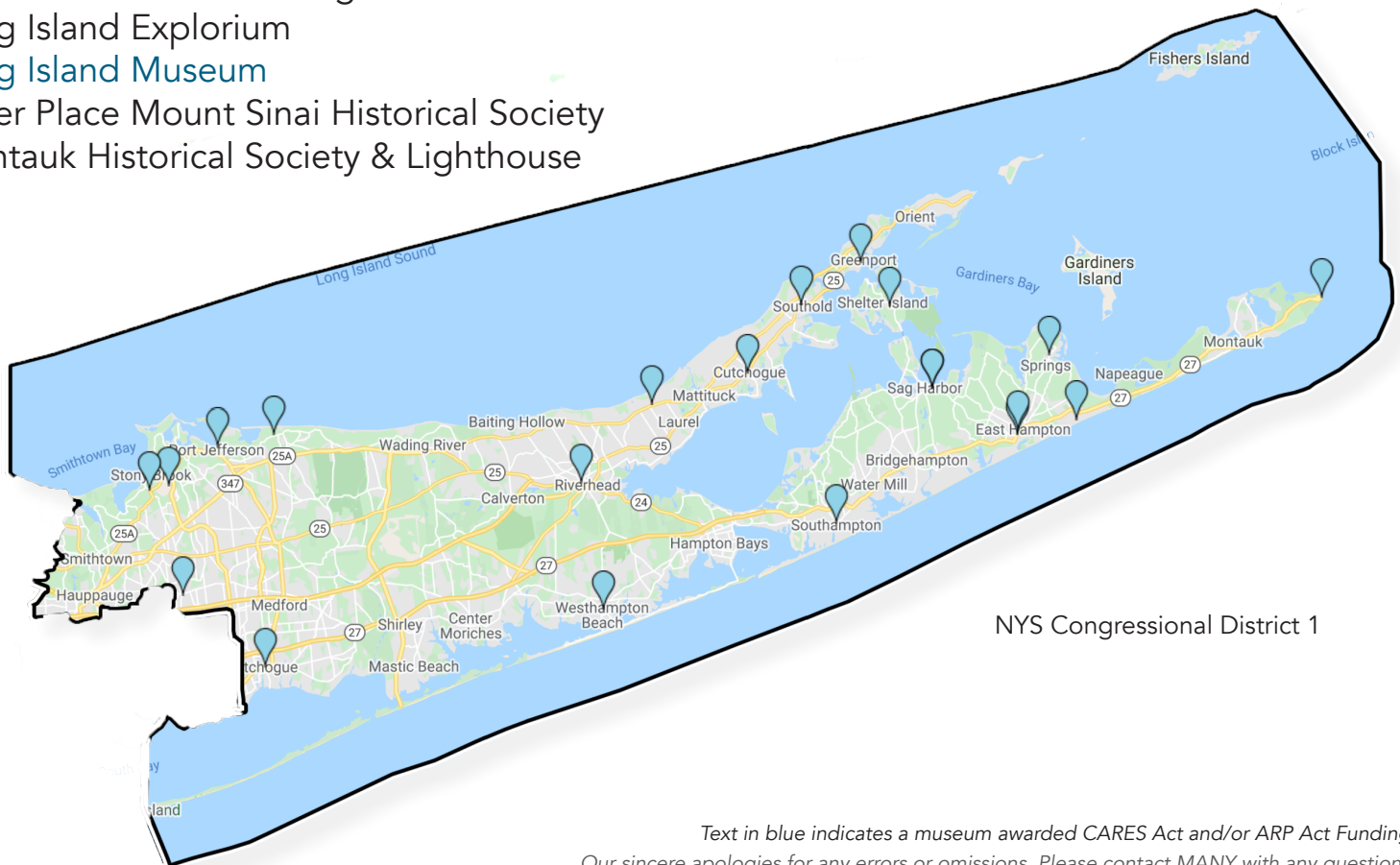
NYS Congressional District 1

New Suffolk Historical Council Parrish Art Museum Pollock-Krasner House & Study Center Shelter Island Historical Society Southampton African American Museum Southampton History Museum Southold Historical Society Suffolk County Historical Society The Bridgehampton Museum The Maritime Explorium Westhampton Beach Historical Society