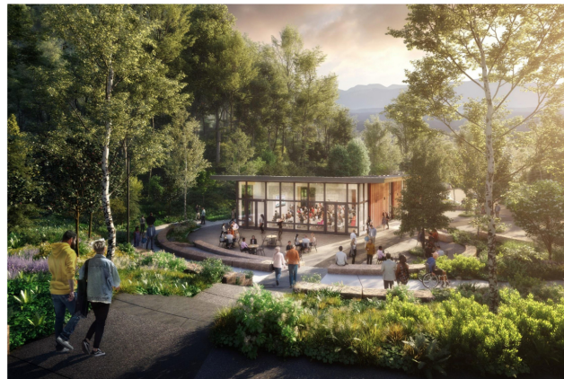
FREDERIC CHURCH CENTER, VIEW FROM LAKESIDE TERRACE TO WEST

In 2024, the Olana State Historic Site will open the Frederic Church Center, a 4,500-square-foot orientation center with ticketing, restrooms, a café, and exhibition space. It will be the first new building at Olana since American painter Frederic Church's death in 1900. It will also be the first publicly accessible carbon-neutral building in New York State. The $11 million project was generated from a 2015 strategic landscape design that encompasses the land and buildings that could be recovered, restored, rehabilitated, and brought into the full public experience.