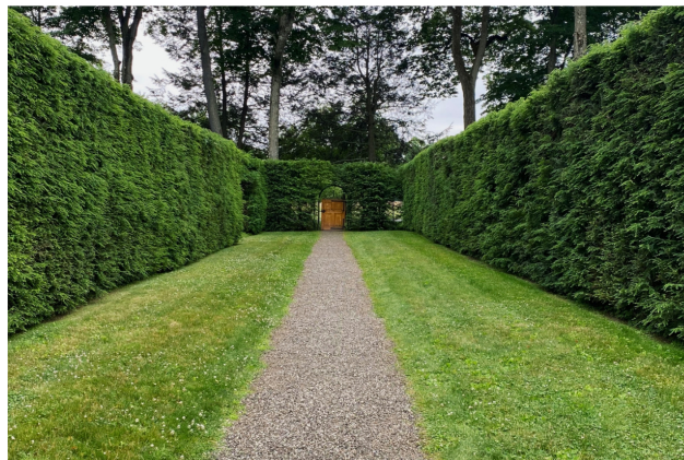
Beatrix Farrand Garden, Bellefield, Hyde Park.