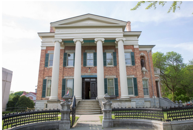
Cayuga Museum of History and Art was awarded funding to update their permanent exhibition on the history of the Auburn Correctional Facility

More than $500,000 awarded to museums in all REDC Regions