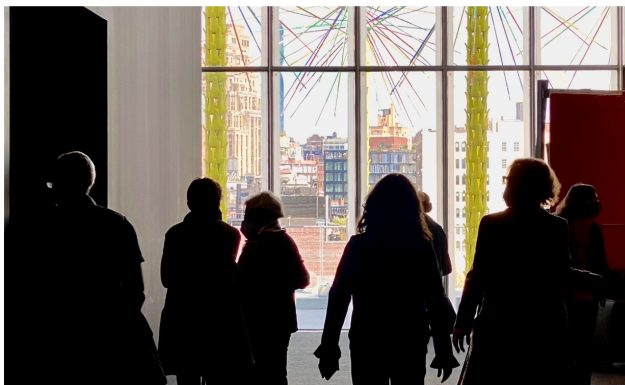
"Quiet as It's Kept" 2022 Whitney Biennial