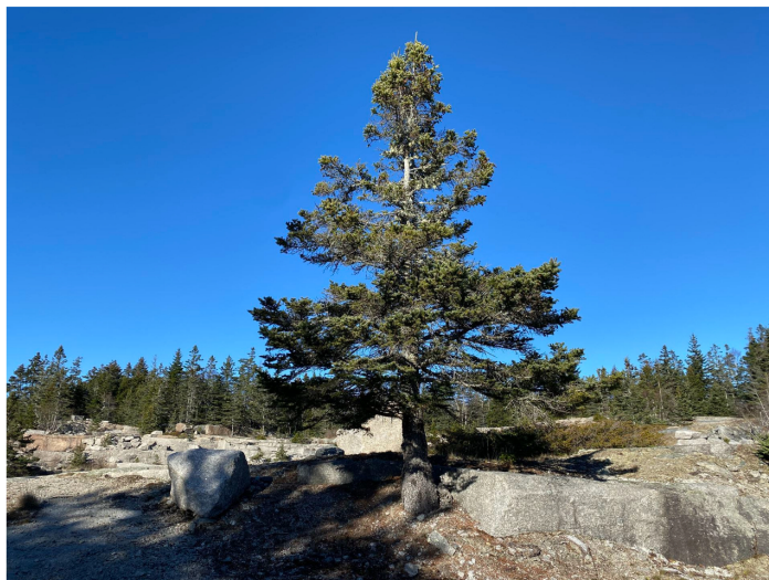
Balsam Fir growing at the edge of a granite quarry that closed for industrial purposes in 1960, making this tree approximately the same age as the Museum Association of NY

The last weeks of 2022 bring MANY's sixtieth year of service to the museum field to a close. Despite the recent hardships we have all experienced, we stand stronger now than ever before. As I look back over all that we have accomplished, I am proud of the ways we brought museum professionals together in person and virtually for critical discussions about contemporary museum practice. I am continually inspired by my colleagues who generously share their time and expertise and I write now to ask for your financial support.